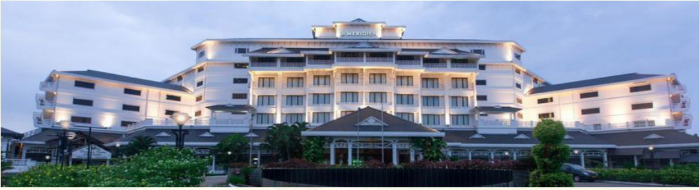
Hotel Le Méridien, Kochi